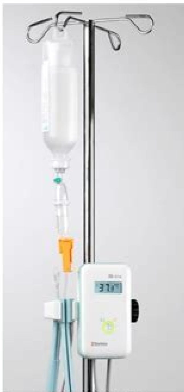
The accessories shown are not included in delivery.